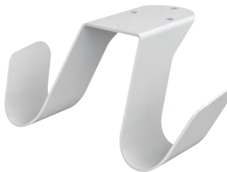
Cable Hook (Part Number.: 1-0250)